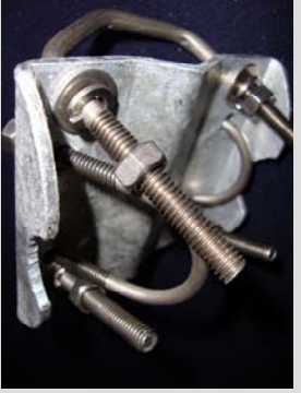
Heavy-duty galvanized clamp w/S.S. hardware